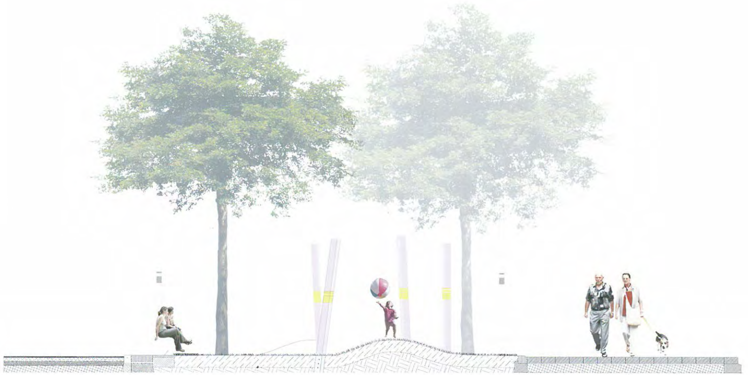
↑ | Ring road, section of layers ↓ | Ring road plan

Address: Aspern, Vienna, Austria. Landscape designers: Acer Campestre. Completion: 2015. Area: 17,300 m 2 . Paving: concrete pavement. Context: ring road and new town center.